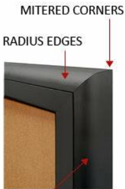
RADIUS EDGES on ALL 4 Sides Sleek and Contemporary Design