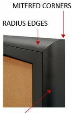
RADIUS EDGES on ALL 4 Sides Sleek and Contemporary Design