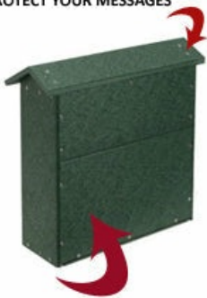
RECYCLED PLASTIC LUMBER IS IMPERVIOUS TO WATER, CHEMICALS, AND INSECTS