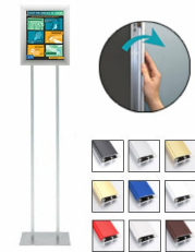
SINGLE or DOUBLE SIDED