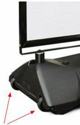
WHEELS ARE BUILT INTO BASE FOR EASY MOVING

Clear .020 polycarbonate overlays are available (1 for each signholder side) for protection to your posters or graphics.