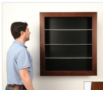
1 3/4" WIDE FRAME PROFILE