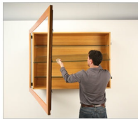
ADJUST YOUR GLASS SHELVES AS NEEDED