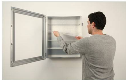
ADJUST YOUR SHELVES AS NEEDED