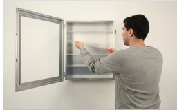
ADJUST YOUR SHELVES AS NEEDED