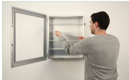
ADJUST YOUR SHELVES AS NEEDED