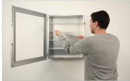
ADJUST YOUR SHELVES AS NEEDED