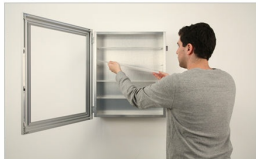
ADJUST YOUR SHELVES AS NEEDED