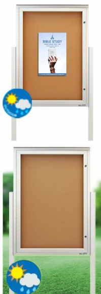
15+ Sizes - Portrait & Landscape