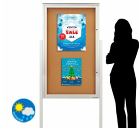
16+ Sizes - Portrait & Landscape