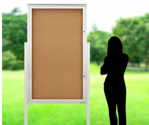
16+ Sizes - Portrait & Landscape