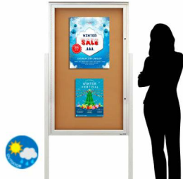
16+ Sizes - Portrait & Landscape