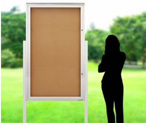
16+ Sizes - Portrait & Landscape