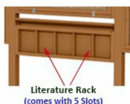
Literature Rack (comes with 5 Slots)