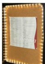
Full Perimeter LED Lighting