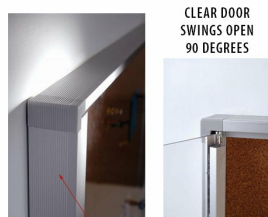
RIBBED ALUMINUM DESIGN (OVERALL DEPTH 1.375")