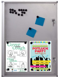
LOCKABLE FROM THE FRONT WITH 2 LOCKS & KEY SET