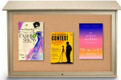
OVERHANG ROOF (BACK VIEW)