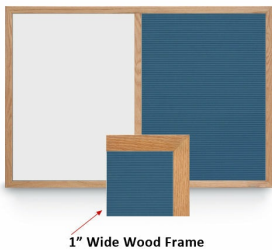
1" Wide Wood Frame