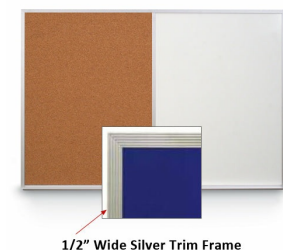
1/2" Wide Silver Trim Frame