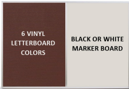
YOU CAN CHOOSE EXACTLY HOW YOU WANT YOUR COMBO BOARD TO LOOK!