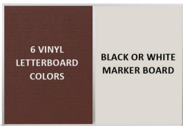
YOU CAN CHOOSE EXACTLY HOW YOU WANT YOUR COMBO BOARD TO LOOK!