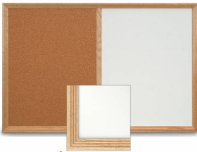
1 1/8" Wide Decorative Wood Frame