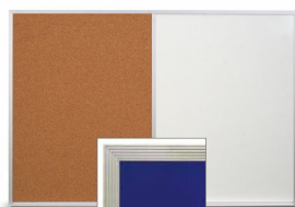
1/2" Wide Silver Trim Frame