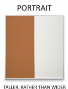
PORTRAIT TALLER, RATHER THAN WIDER