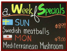
Black Marker Board - Landscape