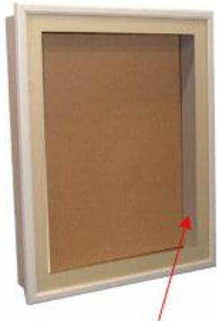
INTERIOR SIDES FINISH AVAILABLE IN WHITE, BLACK OR COMPLIMENTARY FRAME FINISH