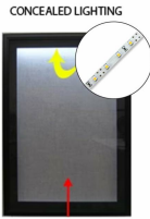
(6) Optional FABRIC COLORS over Natural Tan Cork Board