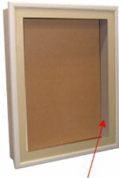
INTERIOR SIDES FINISH AVAILABLE IN WHITE, BLACK OR COMPLIMENTARY FRAME FINISH