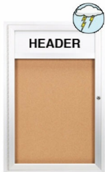
27" x 39" Enclosed CorkBoard (PICTURES SHOWN, NOT TO SCALE)