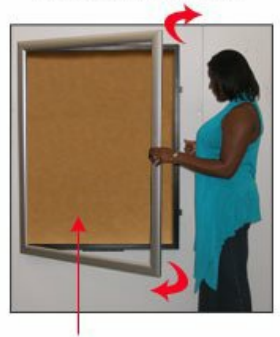
6 FABRIC COLORS ARE AVAILABLE