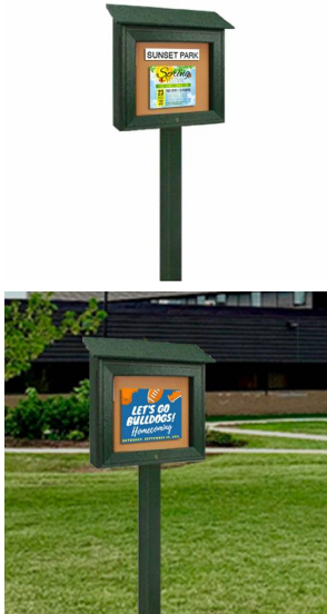
OVERHANG ROOF (BACK VIEW)