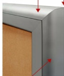
RADIUS EDGES on ALL 4 Sides Sleek and Contemporary Design