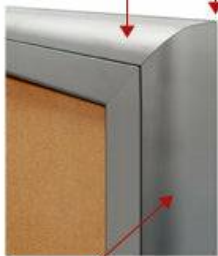
RADIUS EDGES on ALL 4 Sides Sleek and Contemporary Design