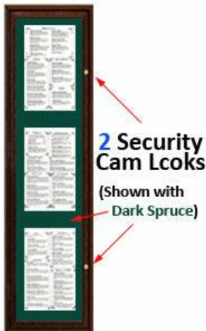
2 Security Cam Lcoks (Shown with Dark Spruce)