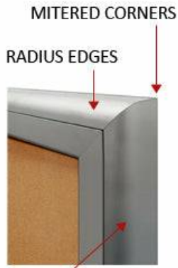
RADIUS EDGES on ALL 4 Sides Sleek and Contemporary Design