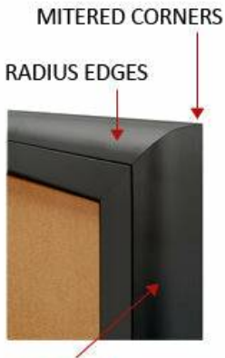
RADIUS EDGES on ALL 4 Sides Sleek and Contemporary Design