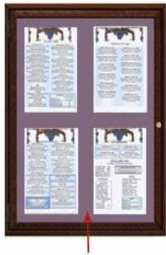
10 Different Fabric Colors to Choose From (Shown is Amethyst Fabric )