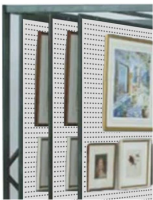
14 Aluminum Finishes