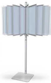
10 Panel Swing Stand Display

FOR CURRENT PRICING, VISIT THE ID # LISTED ABOVE