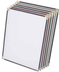
5 BINDING COLORS AVAILABLE

For more information, please click on the Warranty & Returns ICON located above.