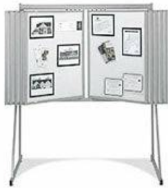
WHITE MATBOARD PANEL DIVIDER WITH LIGHT GRAY FINISH