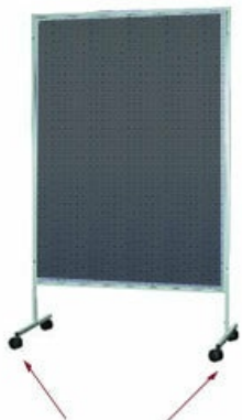
ROLLING CASTERS PROVIDE EASY PORTABILITY