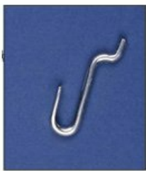
STEEL HOOKS ARE AVAILABLE FOR HANGING YOUR ITEMS