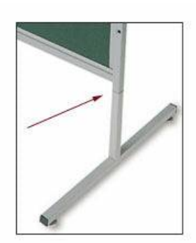
STAND ALONE DISPLAY PANELS REQUIRE LOCKING FEET