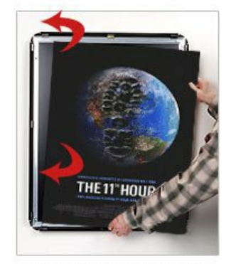
FRONT LOADING - FAST CHANGE OF POSTERS AND SIGNAGE

**Poster Snap Frames are weather resistant...not water-proof