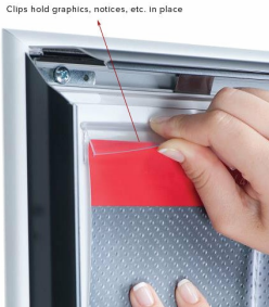
Clips hold graphics, notices, etc. in place