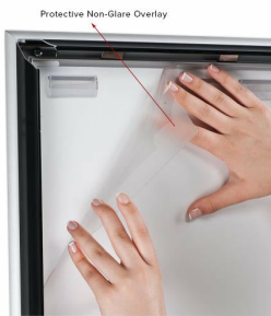
Protective Non-Glare Overlay