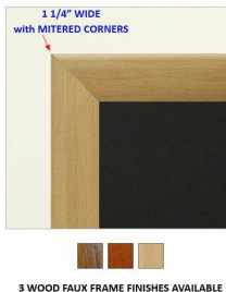
3 WOOD FAUX FRAME FINISHES AVAILABLE