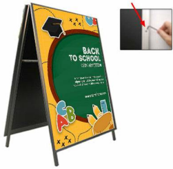
Security Screws Included