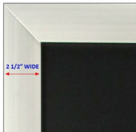
2 1/2" WIDE