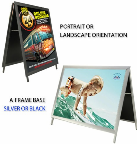
PORTRAIT OR LANDSCAPE ORIENTATION

**PLEASE NOTE: the poster frame and stand are weather resistant, not waterproof or windproof.