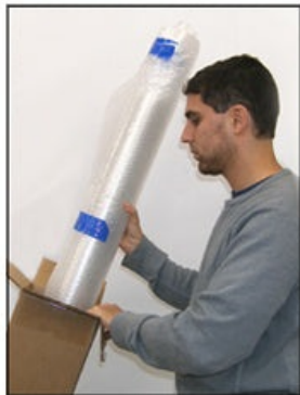
Sizes 24" x 36" and larger ship Unassembled