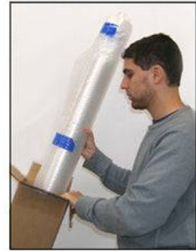
Sizes 24" x 36" and larger ship Unassembled