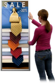
8.5x11 FRAME (PICTURES SHOWN, NOT TO SCALE)

FOR CURRENT PRICING, VISIT THE ID # LISTED ABOVE